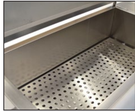
Stainless Steel Tank